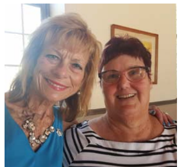
Tea Party attendees.

All proceeds from the event were donated to Thistle Farms. The mission of Thistle Farms is to heal, empower, and employ women survivors of trafficking, prostitution, and addiction. Thistle Farms does this by providing safe and supportive housing, the opportunity economic independence, and a story community of advocates and partners. Thistle Farms believes that, in the end, love is the most powerful force for change in the world. $50 was donated from the Rector's Discretionary Fund toward this event.