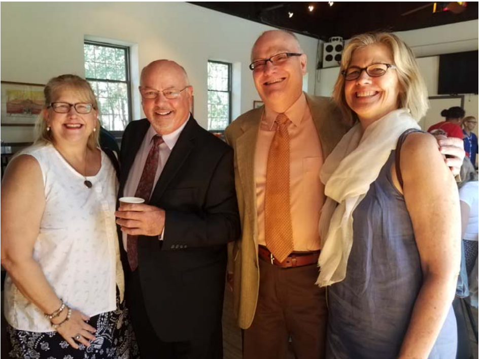
(Hospitality after Lucia Sunday Service)