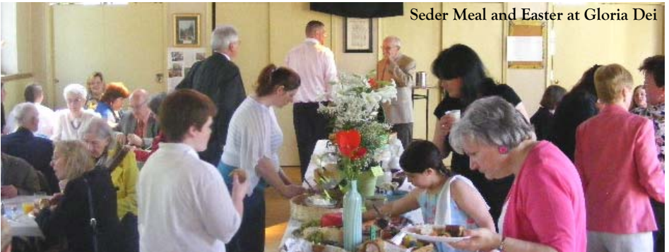
Seder Meal and Easter at Gloria Dei