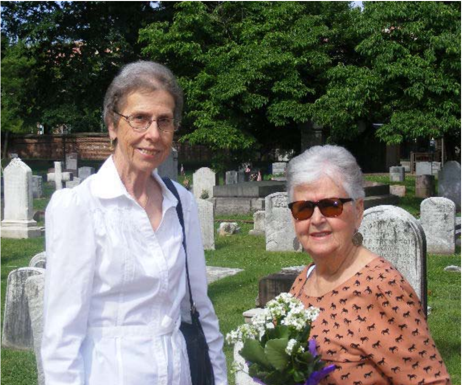
Fathers' Day - remembering our love ones in our graveyard